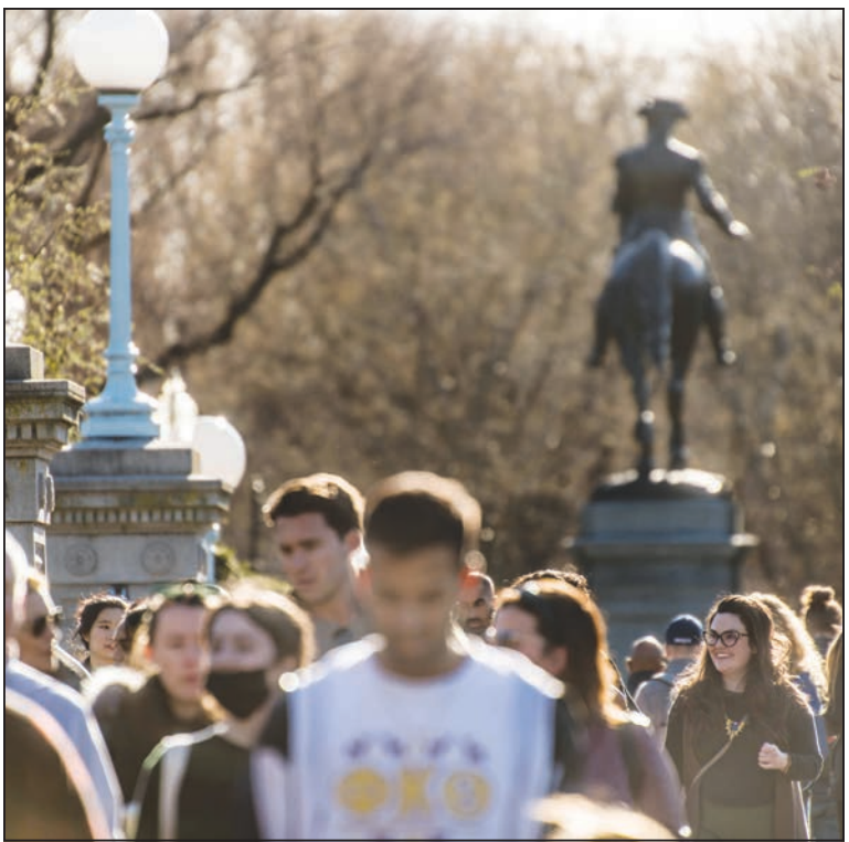
A bustling throng of visitors to the Public Garden cross the Lagoon Bridge on their way to the Boston Common.