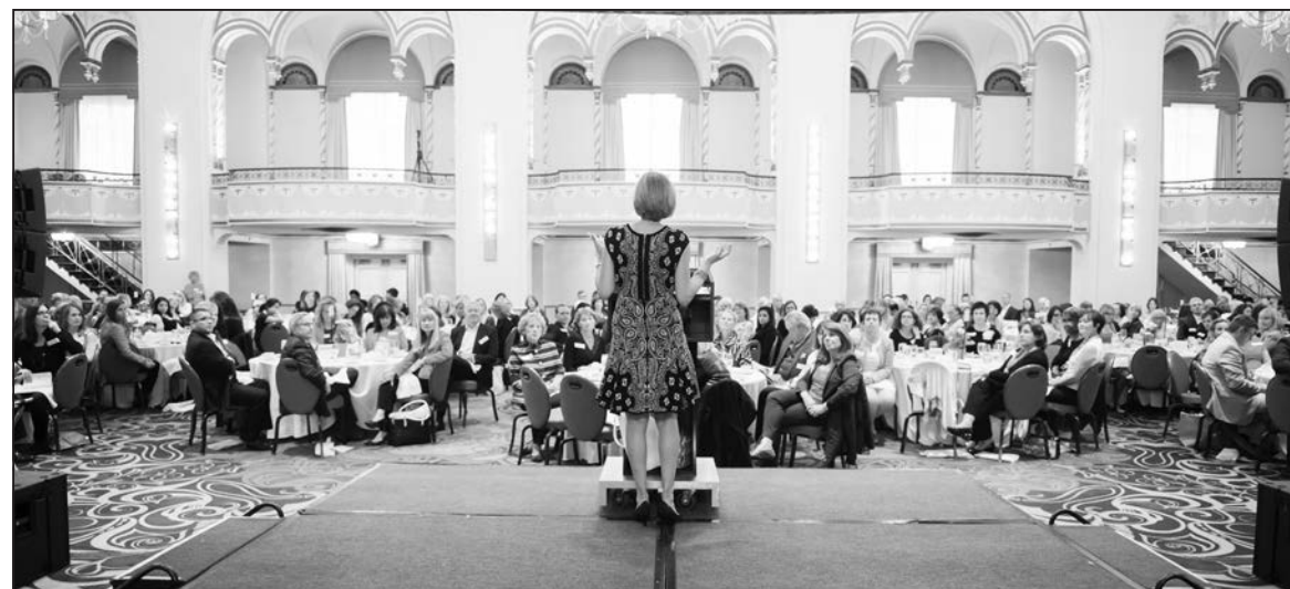
An in-person WLP event from years past. WLP said they are excited to host an in-person fundraiser once again this spring.

If you cannot make it to the event but would still like to make a donation, visit womenslunchplace.org/donate-elig-donation .