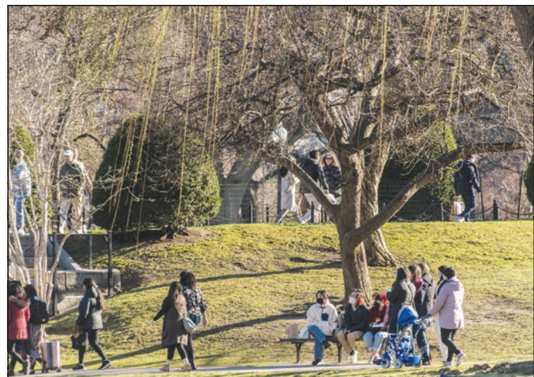
Visitors take in the Victorian splendor of an awakening Public Garden.