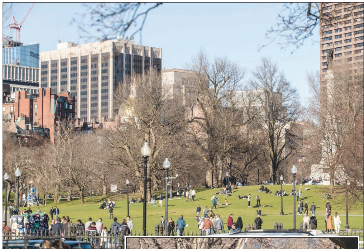
Shown above, Boston Common had a good share of visitors as well enjoying a beautiful Spring day.

She said that currently, 183 people are living in those sites