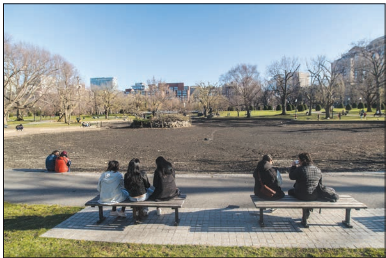
Shown above and right, Visitors to the Public Garden enjoy the pleasant Spring day by the Lagoon, still drained before warmer days bring back the water, birds, and Swan Boats.

and Boston Common, saw many visitors looking to enjoy them. It was another sign of life returning to the City Of Boston after 2 long years of the Covid Pandemic.