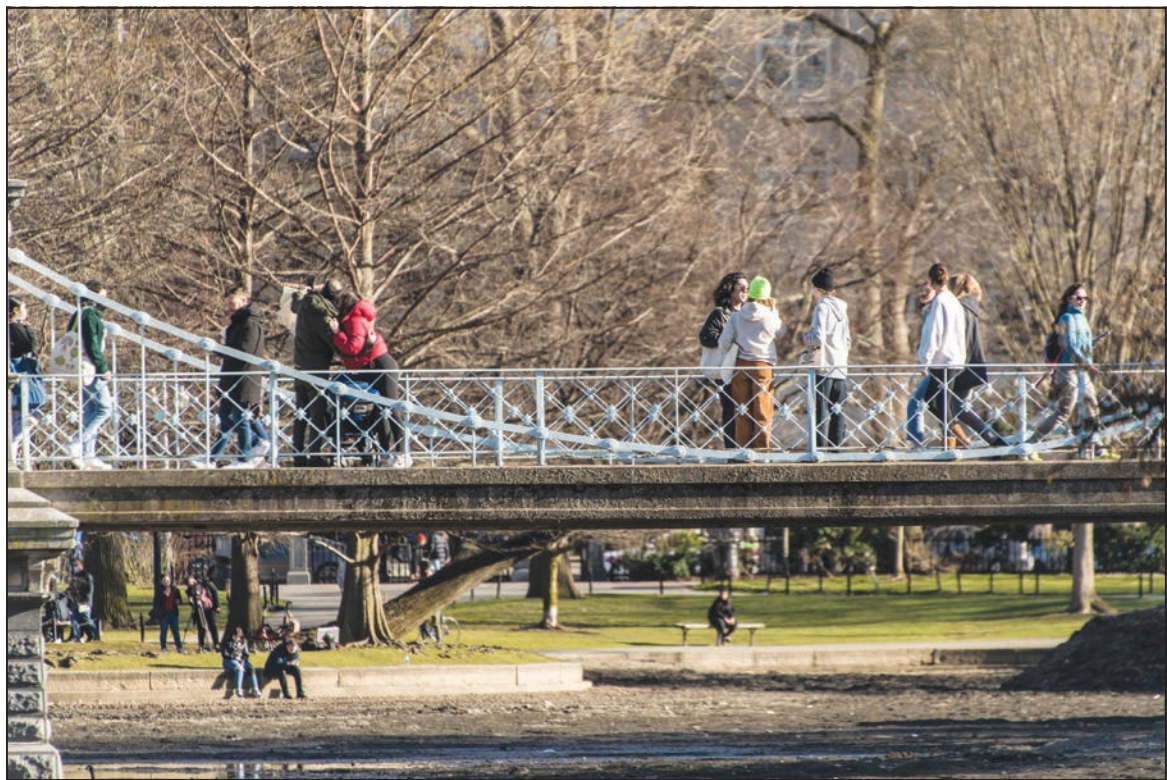
Visitors to the Public Garden enjoy the views from the Lagoon Bridge.