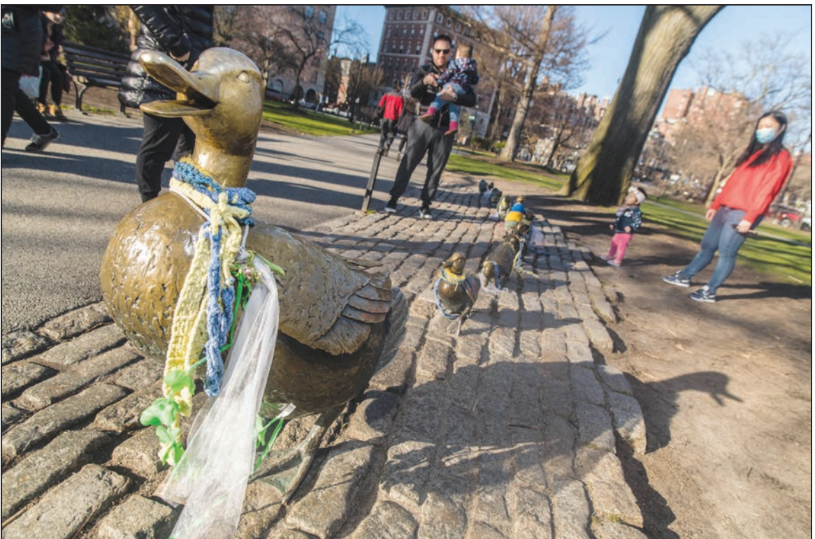
The Make Way For Ducklings Sculpture was adorned with the colors of the Ukrainian flag showing solidarity to the war-torn nation.