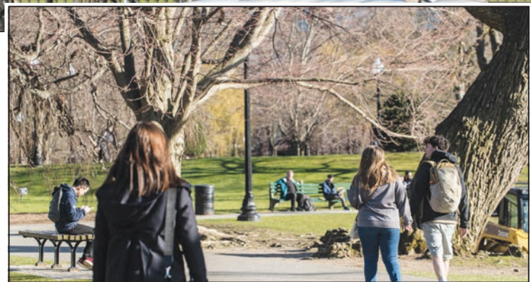
Shown left, Spring was bringing life back to the Public Garden with a pleasant if not brisk day.