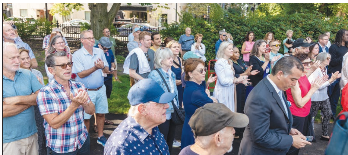
Supporters gathering in the Boston Public Garden for the re-opening of the child fountains on September 17.