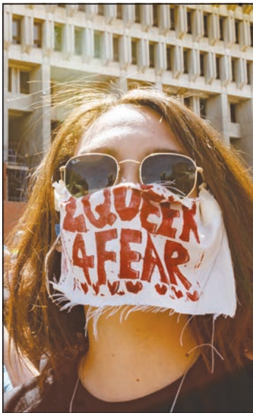
Counter-protesters outside of the Straight Pride Parade rally made their viewpoints known.