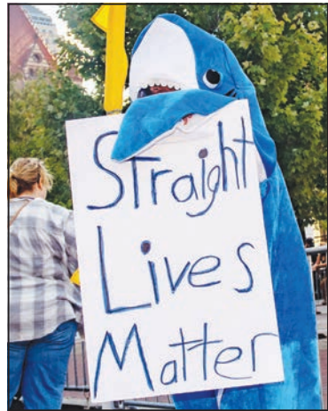
A participant in the Straight Pride Parade dressed as a shark, for some reason.

dubbed the Straight Pride flag. Some 34 people, mostly counter-protesters were arrested at the parade. Well-known conservative commentator and provocateur Milo Yiannopoulos served as the grand marshal and keynote speaker.