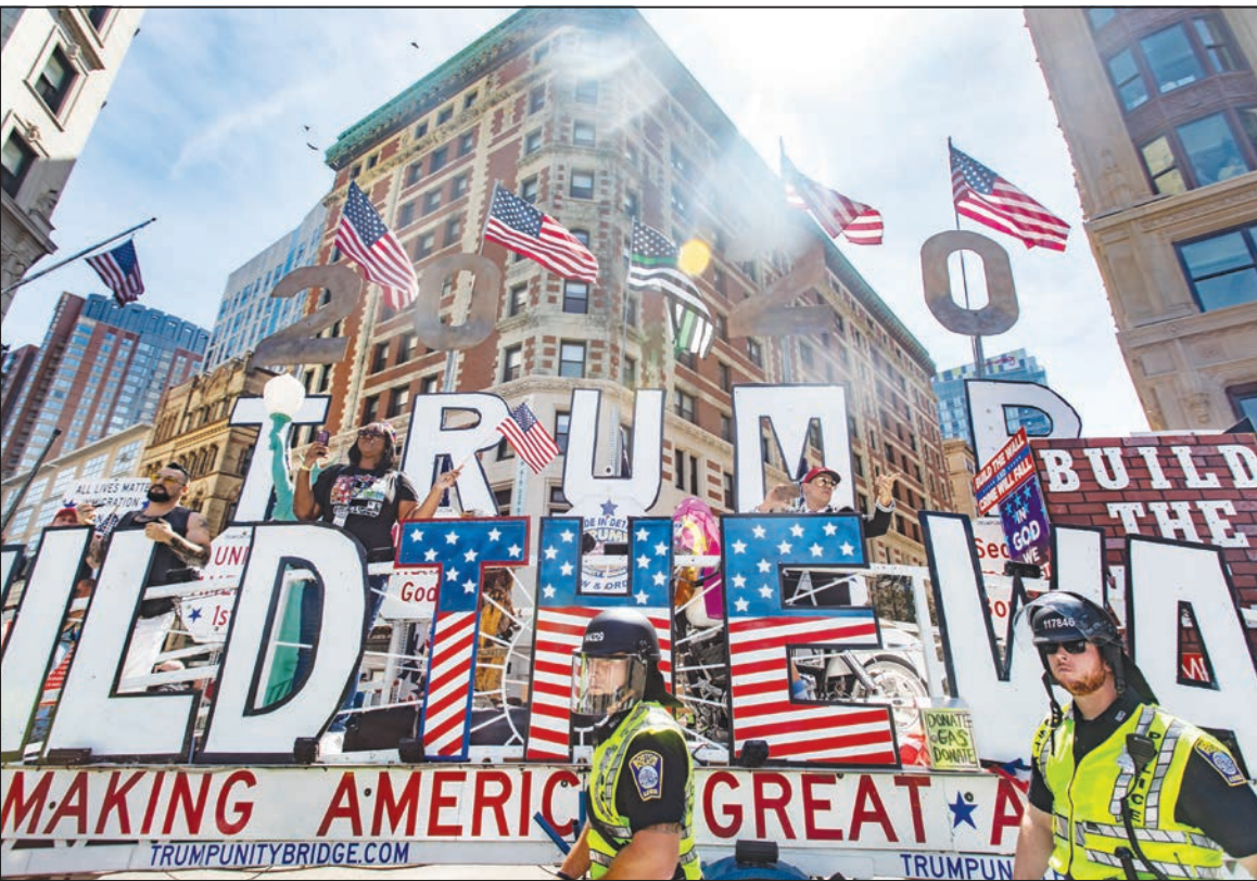
Shown above, riding on the Trump Unity Bridge float, is well-known conservative commentator Milo Yiannopoulos, the grand marshal of the Parade. Shown left, Counter-protesters stand outside of the fenced area where the Straight Pride Parade was held. Many in the crowd felt that the Straight Pride effort was a slap in the face to the struggles faced by the LGBTQ community.