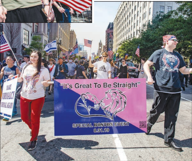
The Straight Pride Parade goes down Boylston Street.