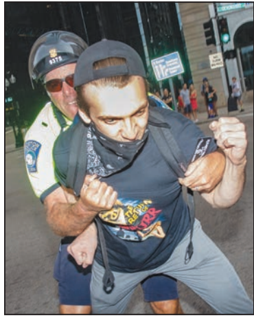
A counter-protester is detained by Boston Police outside of the Straight Pride Parade rally downtown.